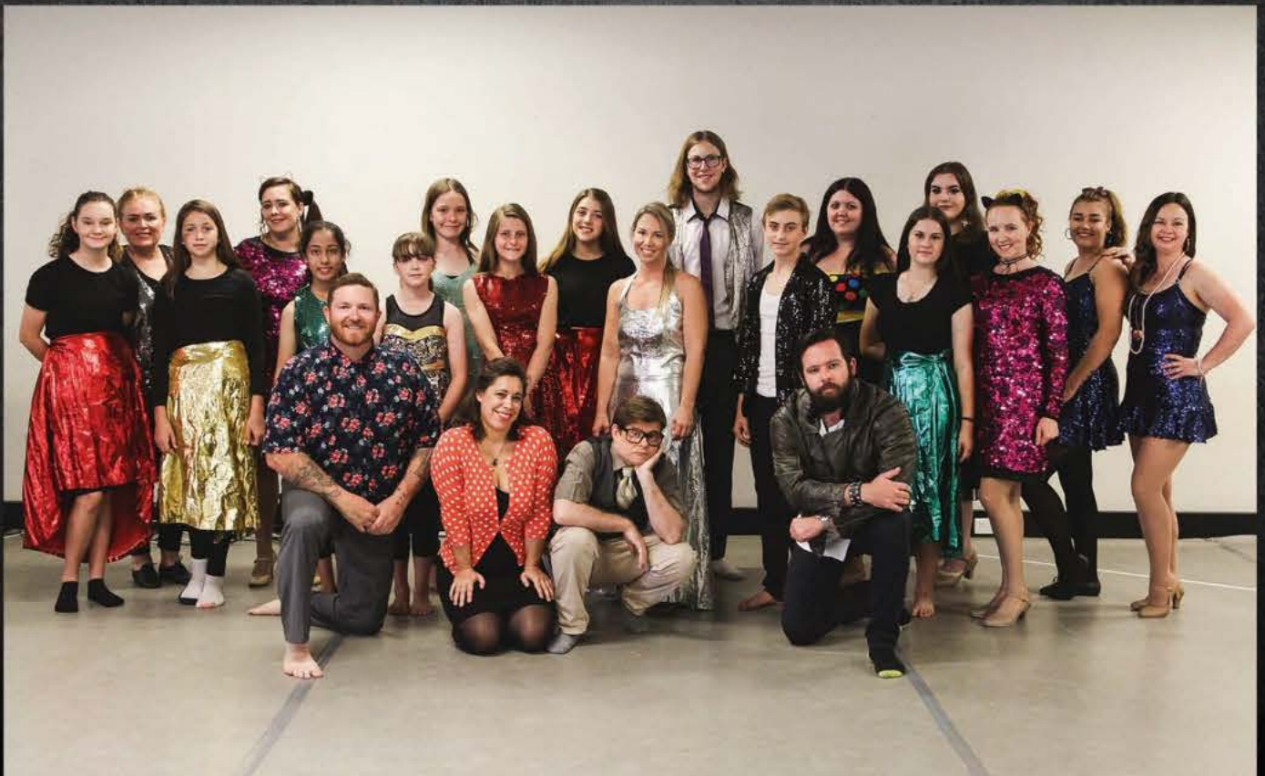
PHOTO OF THE LITTLE SHOP OF HORRORS CAST

Innocent, beautiful lovely Audrey who finally sees him, Such love, so many dances it's a shame that Seymour finally gives in. Following a slippery slope of dances and blood, He reflects remorseful and thinks about what could, Help in righting this wrong, And we do it all to a dance and a song!